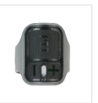
BT wireless ring PTT