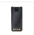
Li-polymer battery 3000mAh