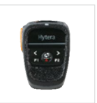
BT Wireless remote speaker microphone