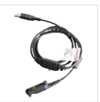
Programming cable (USB port)