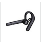
BT Wireless earpiece