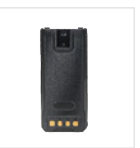
Li-polymer battery 2400mAh