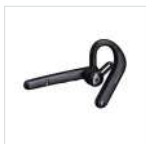
BT Wireless earpiece