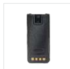
Li-polymer battery 2400mAh