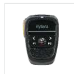
BT Wireless remote speaker microphone