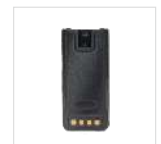
Li-polymer battery 3000mAh