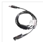
Programming cable (USB port)