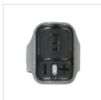
BT wireless ring PTT